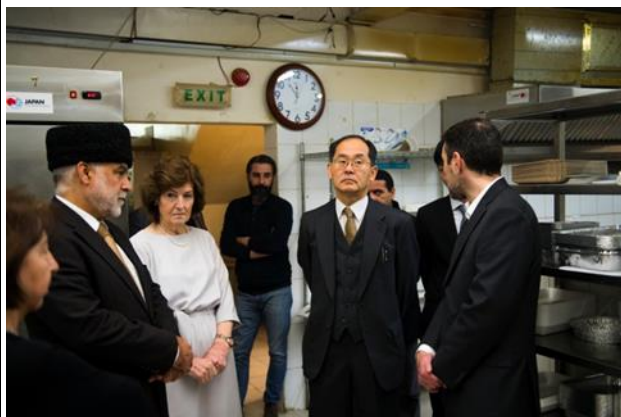
Brief Project Explanation at SAMAWER kitchen