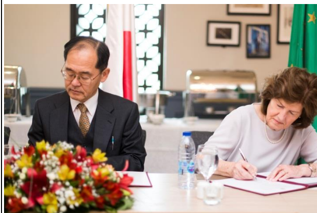
Signing of the Grant Contract