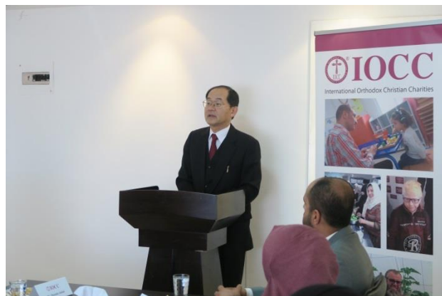
Speech by the Ambassador