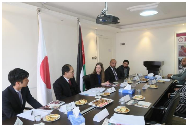
Project Briefing from IOCC