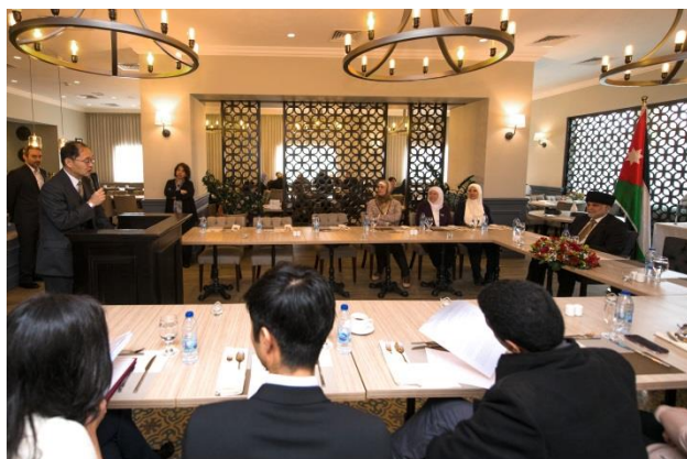
Speech by Ambassador