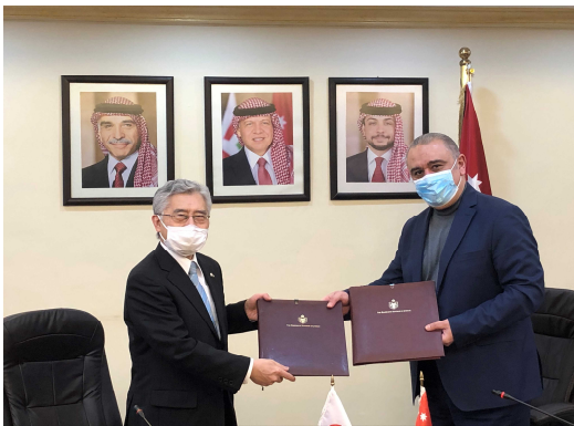
Exchange of Notes between

Japan has been continuously supporting the water sector in Jordan for decades, including the previous grant aid to expand the Zai Water Supply System from 1996 to 2001, which in total amounted to 8,697 million Japanese yen, approximately 83.5 million US Dollars.