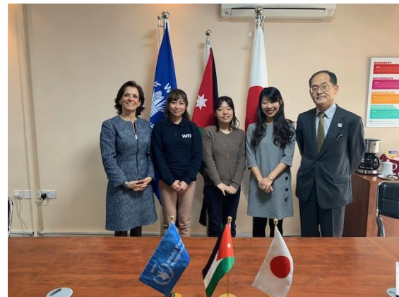
Photo with Japanese staffs of WFP