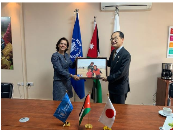
Gift from WFP