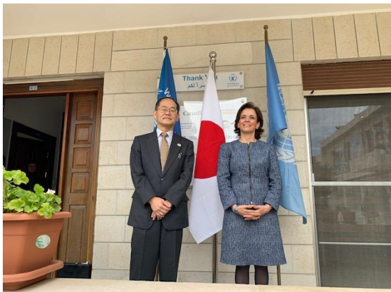
Ambassador and WFP Representative