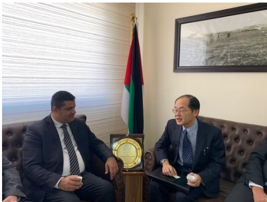
Project Briefing from the Mayor