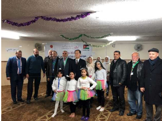
Welcome by Children supported by the Association