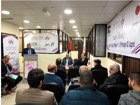
Opening of Signing Ceremony