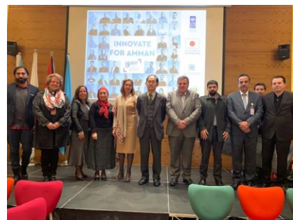
Group photo with Representatives from UNDP and GAM