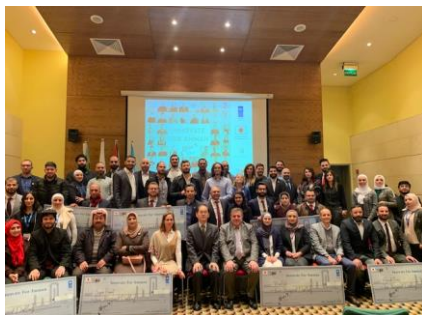
Group Photo with “Start-ups”