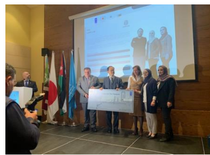
Awarding Investment Funds