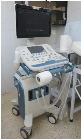
Cardiology ultrasound provided under GGP