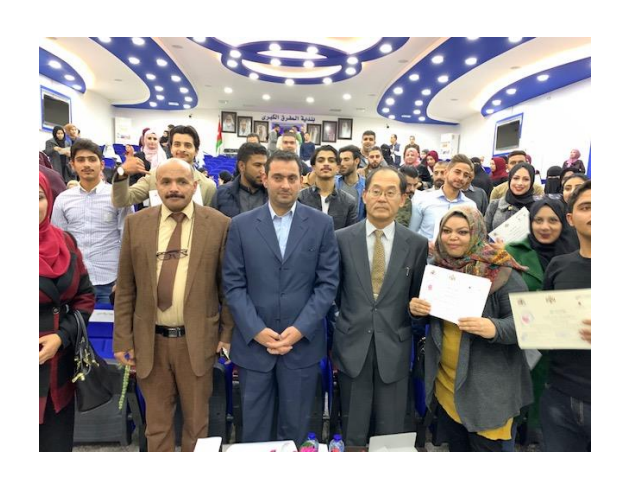
Group photo with Graduates