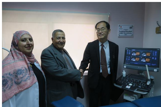
Handover of 4D Ultrasound Equipment (From the Ambassador to the Chairman)