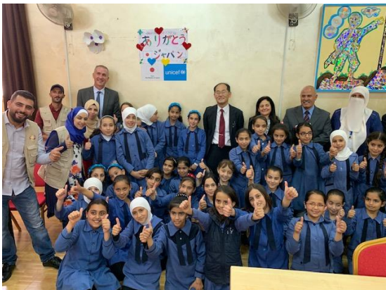
With Students of "Water conservation awareness class"