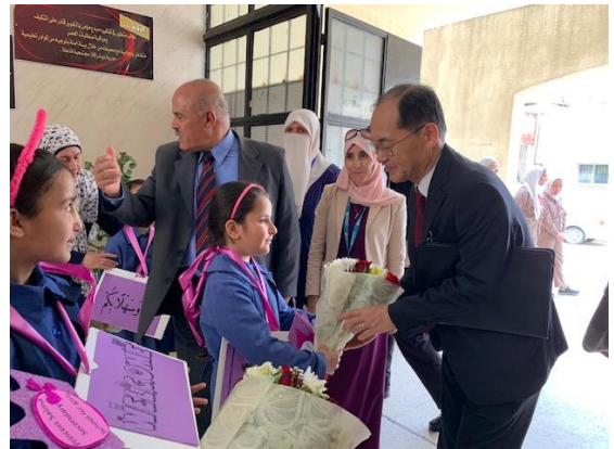
Welcoming by Students