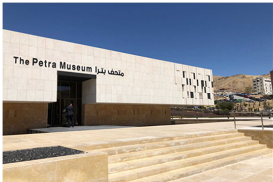
Exterior appearance of the Museum