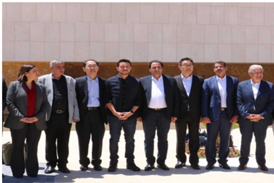
Group Photograph with H.R.H. Crown Prince

Many of the participants in the ceremony expressed their appreciation for Japanese generous support for the project.