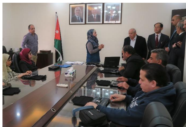
Training for Braille Device Provided under GGP