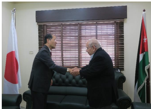
Greeting with HRH Prince Ra'ad Bin Zeid