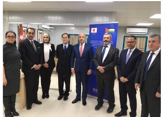
Group photo with Secretary General and IOM representative