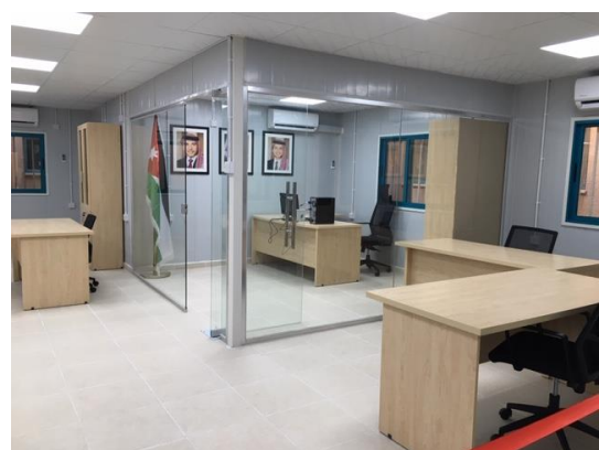
Refurbished Consular Section inside MOFA of Jordan