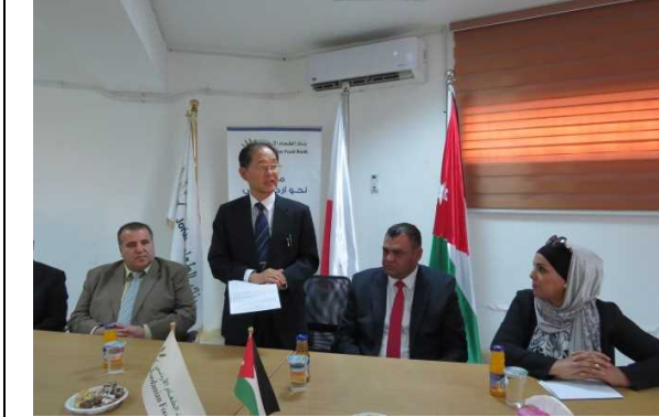
Speech by Ambassador