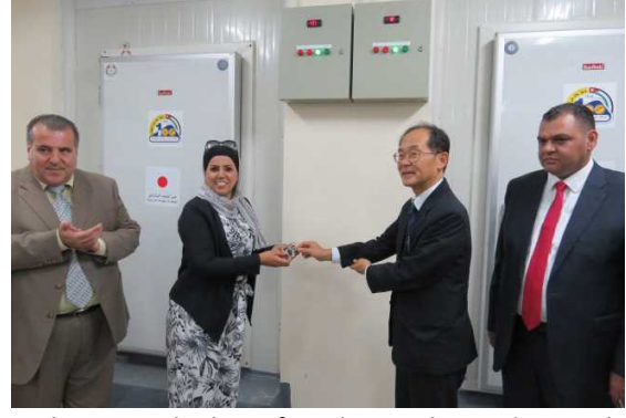
Handing over the key of Cooling and Freezing Facility