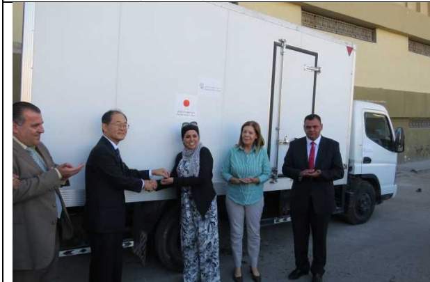
Handing over the key of Cooling Truck