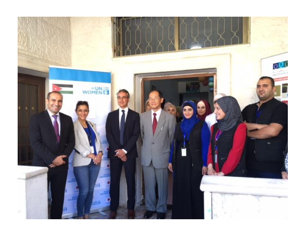
With staffs of Institute for Family Health