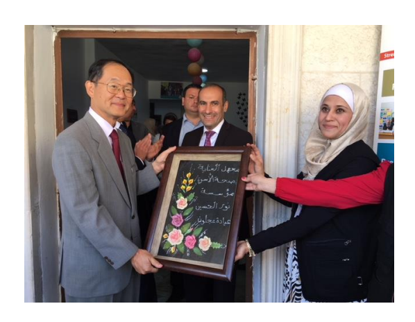
Gift from beneficiaries of IFH