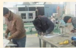
Project for strengthening the capacity of training management of vocational training corporation (2006-2010)