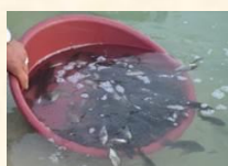
Trilateral Cooperation Project "Introduction of Advanced Agricultural Technology under Trilateral Cooperation (1) Tropical fruits production (2) Tilapia farming experiment