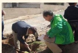
Project for formulating water supply plan for the host communities of Syrian refugees (2013-2016)