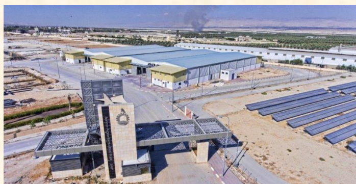
JAIP: Jericho Agro-Industrial Park

In 2006, Japan proposes its concept of creating "The Corridor for Peace and Prosperity" in cooperation with Israelis, Jordanians and Palestinians. The concept is to work collaboratively to materialize projects that promote regional cooperation for the prosperity of the region, such as establishing the Jericho Agro-Industrial Park (JAIP) in the West Bank and facilitating the transportation of goods.