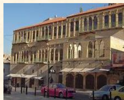
Salt Tourism Sector Development Project in 1999