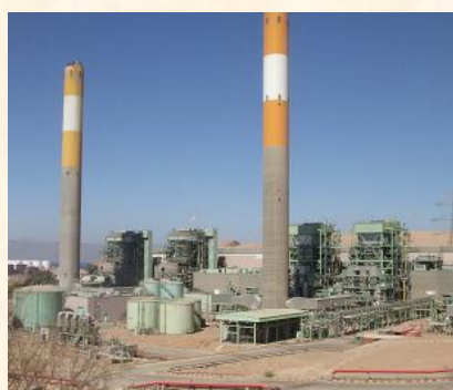
Aqaba Thermal Plant in 1994/1996

*Japanese Fiscal Year (FY) runs from April 1 st to March 31 st