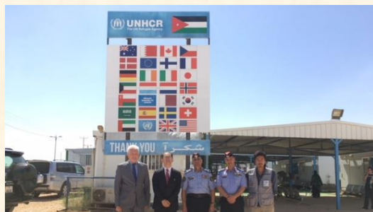
Grant aid for UNHCR, at the launching ceremony

In response to the serious humanitarian situations in Syria and neighboring countries, Japan has enforced the support to both refugees and IDPs with international organizations.