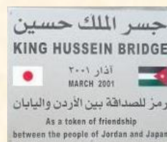
Construction of the King Hussein Bridge (FY 1999: 1,215 million yen)