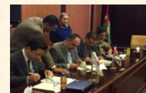
Project for the study on electricity sector master plan in Jordan (2014-2017)