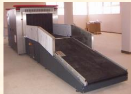
Project for Improvement of Airport Security Equipment (FY 2009: 1,473 million yen)