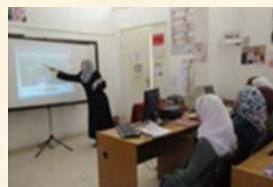
Capacity development of Learning Resources Centers (LRCs) for science education utilizing ICT (2006-2009)