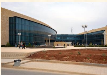
Jordan University of Science and Technology in 2012