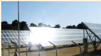
Project for Introduction of Clean Energy by Solar Electricity Generation System (FY2010: 640million yen)