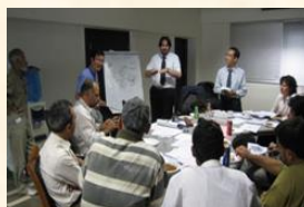
Project on dissemination of quality/productivity improvement practices for small and medium enterprises (2010-2013)