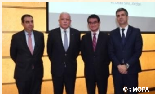
The Sixth Ministerial-Level Meeting of the Four-Party Consultative Unit chaired by Kono Foreign Minister (2018)