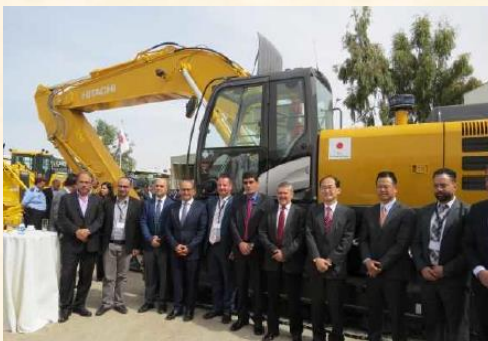
Hand over ceremony of Machinery for solid waste management to Ministry of Municipal Affairs (2018)

The grant for import of goods necessary to promote economic and social development efforts by the recipient countries.