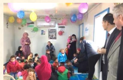
UN Women: Safe space for women & girls “Oasis” in Azraq refugee camp