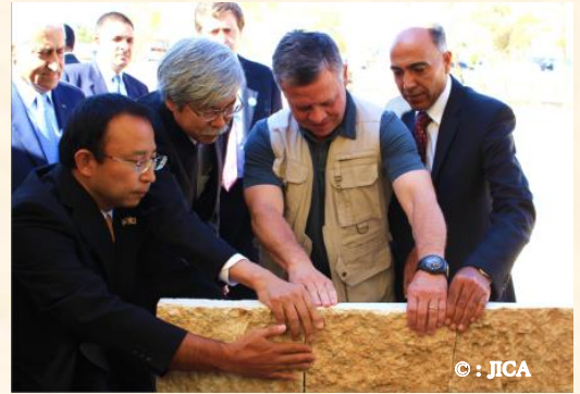
Construction of Petra Museum (Cultural grant assistance) (FY2013-2014: 784 million yen) *Schedule to be completed in 2018