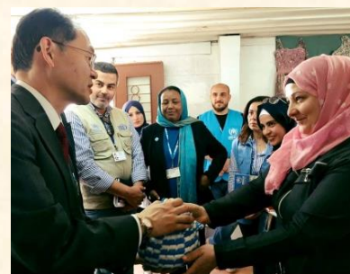
UNHCR: Opening ceremony of community center project in Zaatari refugee camp