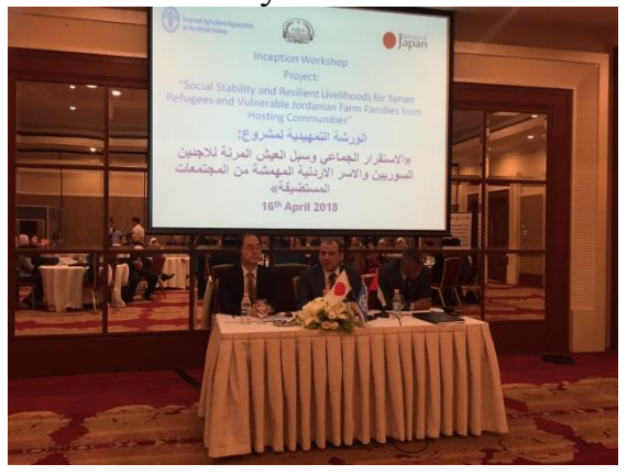
Speech by the Ambassador