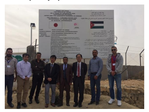
Pumping station renovated by the project