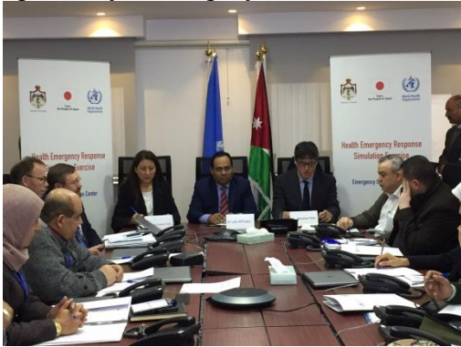
Speech by the Deputy Chief of Mission