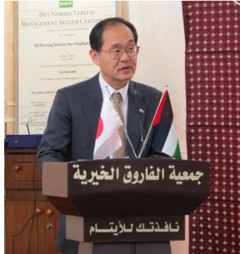
Speech by the Ambassador