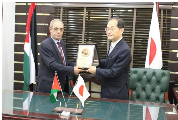
Commemorative gift for the ambassador