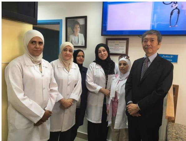
Staffs at the JAFPP health clinic