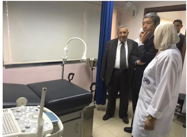
Tour of the laboratory by the Ambassador