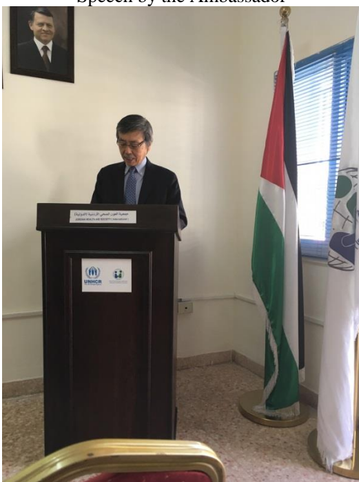
Speech by the Ambassador