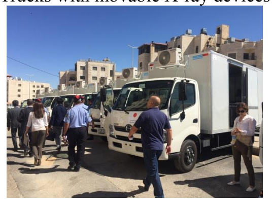
X-ray device installed in the truck