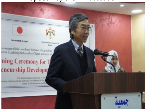
Speech by the Ambassador