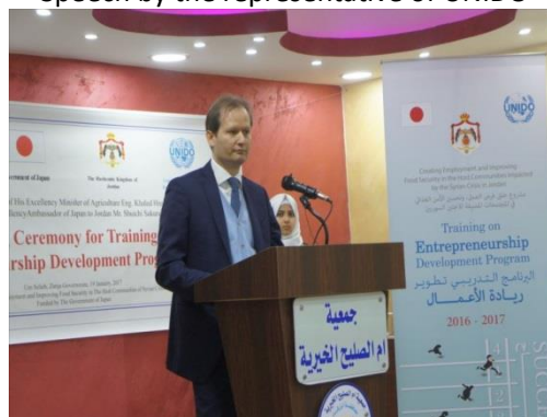
Speech by the representative of UNIDO