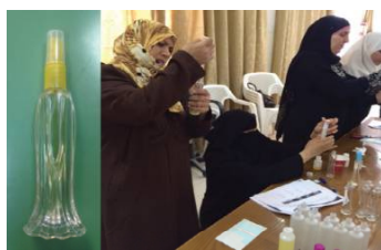
Training for perfume making