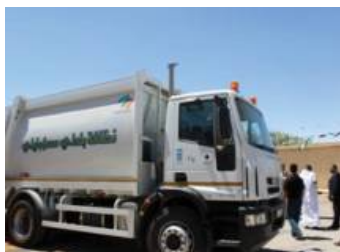
Improved delivery of municipal and social service.