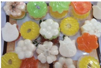
“Hand-made soap” training for women who cannot work outside

IN 2006, Japan proposed its concept of creating “the corridor for peace and prosperity:” in cooperation with Israelis, Palestinians and Jordanians. The concept is to work collaboratively to materialize projects that promote regional cooperation for the prosperity of the region. JICA (Japan International Cooperation Agency) has implemented numbers of projects for empowering and enrichment of refugees, and various kinds of supports in Jordan.