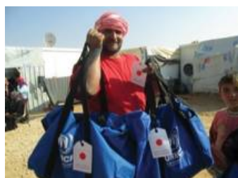
Winter Clothes Distribution.