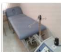
Supporting the Children with Disabilities