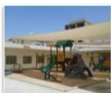
Improving the KG playground