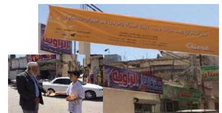
Awareness raising for Women' working outside of houses