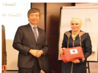
Fist Aid Training Kit.