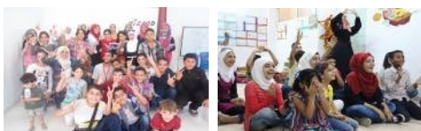
Psychosocial Care Workshop for children in Zarqa