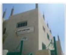
Second Floor renovation