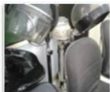
Supporting Income Generating for Women's Society