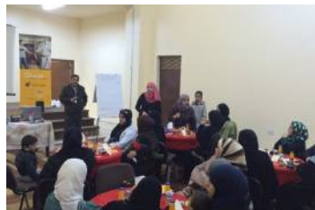
Workshop for the awareness raising of Women's work opportunity