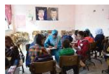
Remedial class in Public schools in Amman