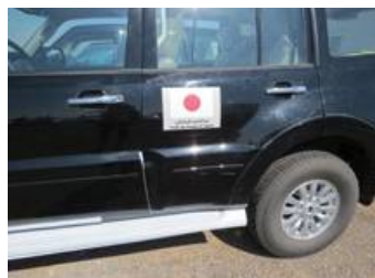
Providing cars in Azraq Camp.

27,698 million $ UNICEF, WFP, UNHCR, IFRC, IOM, UNOPS, UNODC, UN Women