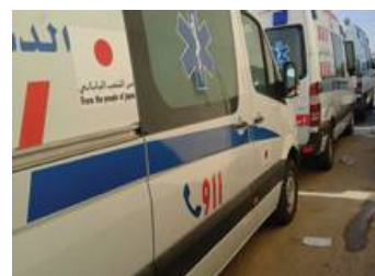
Providing cars in Azraq Camp.