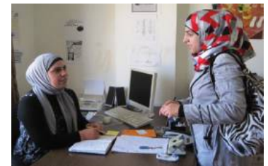
Career Counselling for Women