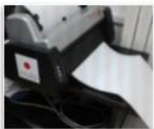
Improvement of Educational Facility for the Blind

The Government of Japan has implemented the grant assistant to non-profit organizations that implement development projects at grass-roots level including international/ local NGOs, local public authorities, educational institutions, hospitals and medical institutions. This project targets to improve Basic Human Needs in Jordan. Since 1990 , The Government of Japan has supported 136 projects in many fields such as renovations of schools, providing medical equipment or items for productive kitchen, and so on.