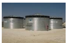
Providing Water Supply System in Zaatari Refugee Camp