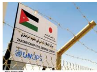
Civil Defense Center in Zaatari Camp.