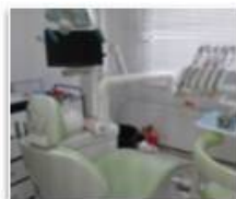
Improvement of Medical Equipment