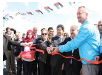
Waste Water Treatment in Zaatari camp.