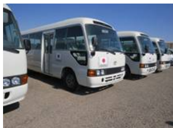
Providing cars in Azraq Camp.