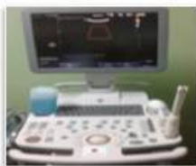
Upgrading the Ultrasound Equipment