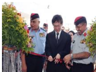
Civil Defense Center in Zaatari Camp.