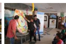
Non-formal Education in Zaatari Refugee Camp