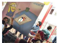
Providing Hygiene Education in schools in Jordan