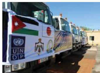
Providing Social Service Equipment.

19,183 million $ UNICEF, WFP, UNHC, IFRC, IOM, UNIDO, UNOPS