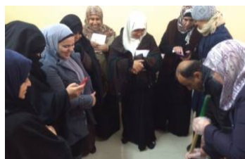
Training for Olive Oil Soap